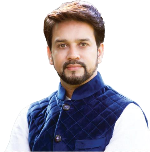
Shri Anurag Thakur

Hon'ble Minister of Commerce & Industry, Consumer Affairs & Food & Public Distribution and Textiles, Govt. of Bharat