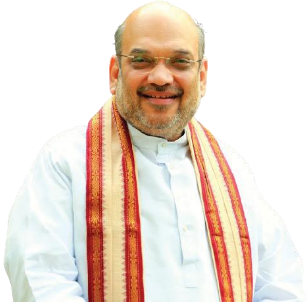
Shri Amit Shah