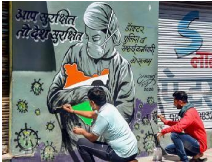
Developed India Graffiti