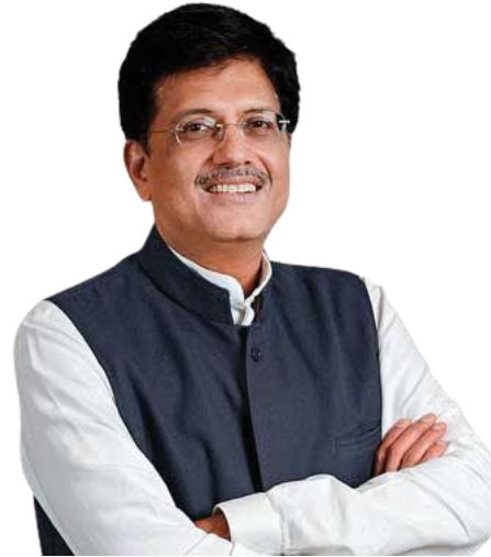
Shri Piyush Goel

Hon'ble Minister of Commerce & Industry, Consumer Affairs & Food & Public Distribution and Textiles, Govt. of Bharat