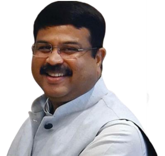
Shri Dharmender Pradhan

Union Minister for I&B and Youth Affairs & Sports, Govt. of Bharat