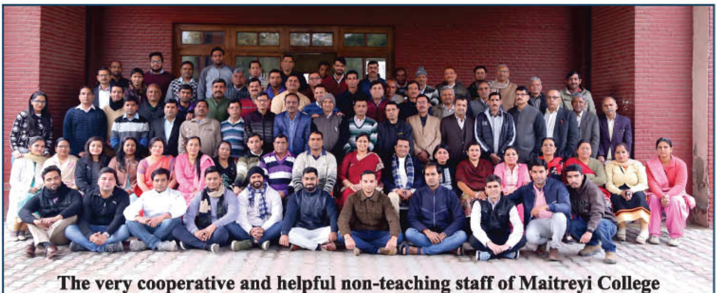
The very cooperative and helpful non-teaching staff of Maitreyi College